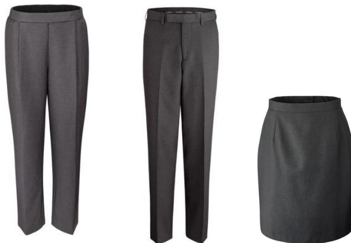
Girls' Fitted Trousers

All students wear smart trousers or a skirt as part of their school uniform. These are compulsory and can only be purchased from School Blazer. We advise that all students buy at least two pairs of trousers or skirts in total.