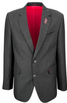
Boys' Fitted Jacket

All students wear a smart jacket as part of their school uniform. These are compulsory and can only be purchased from School Blazer.