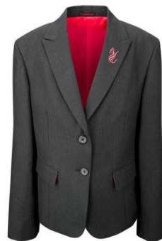
Girls' Fitted Jacket