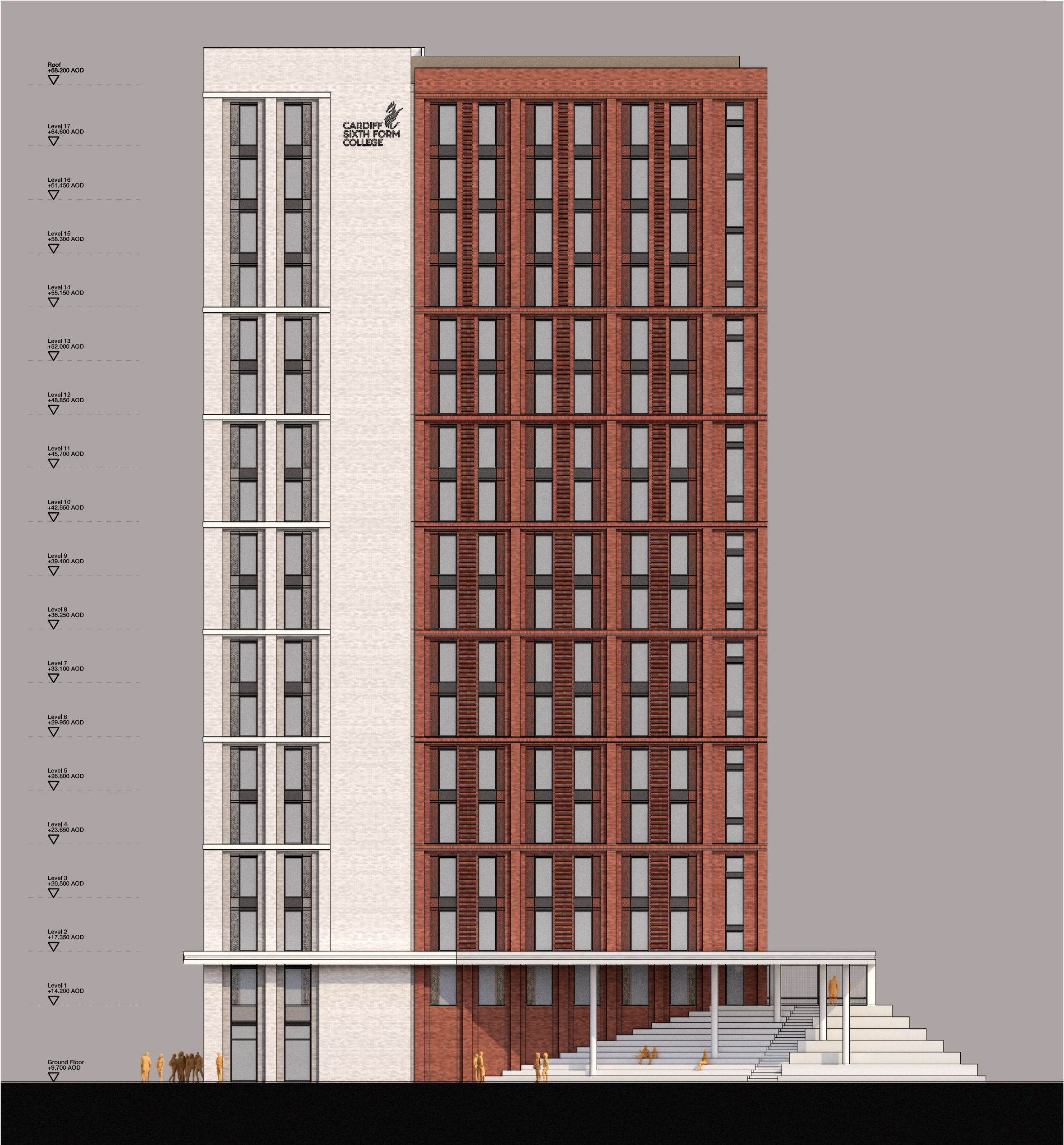
02 North-East elevation 1:200

DO NOT SCALE. All dimensions must be checked on site, errors are to be reported.