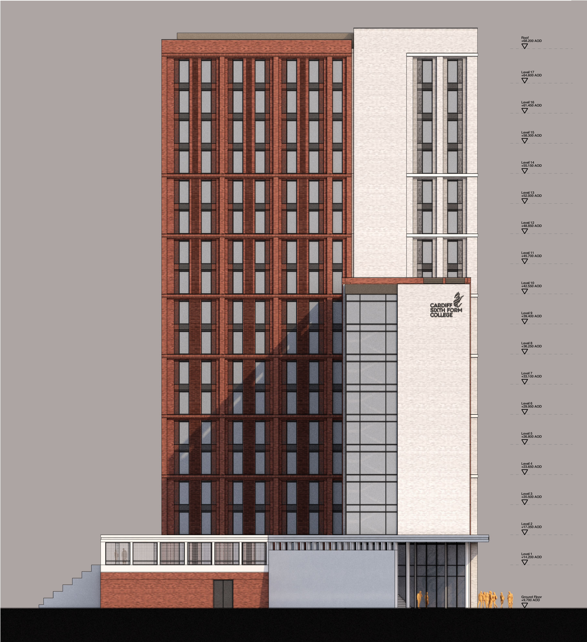
01 South-West elevation 1:200