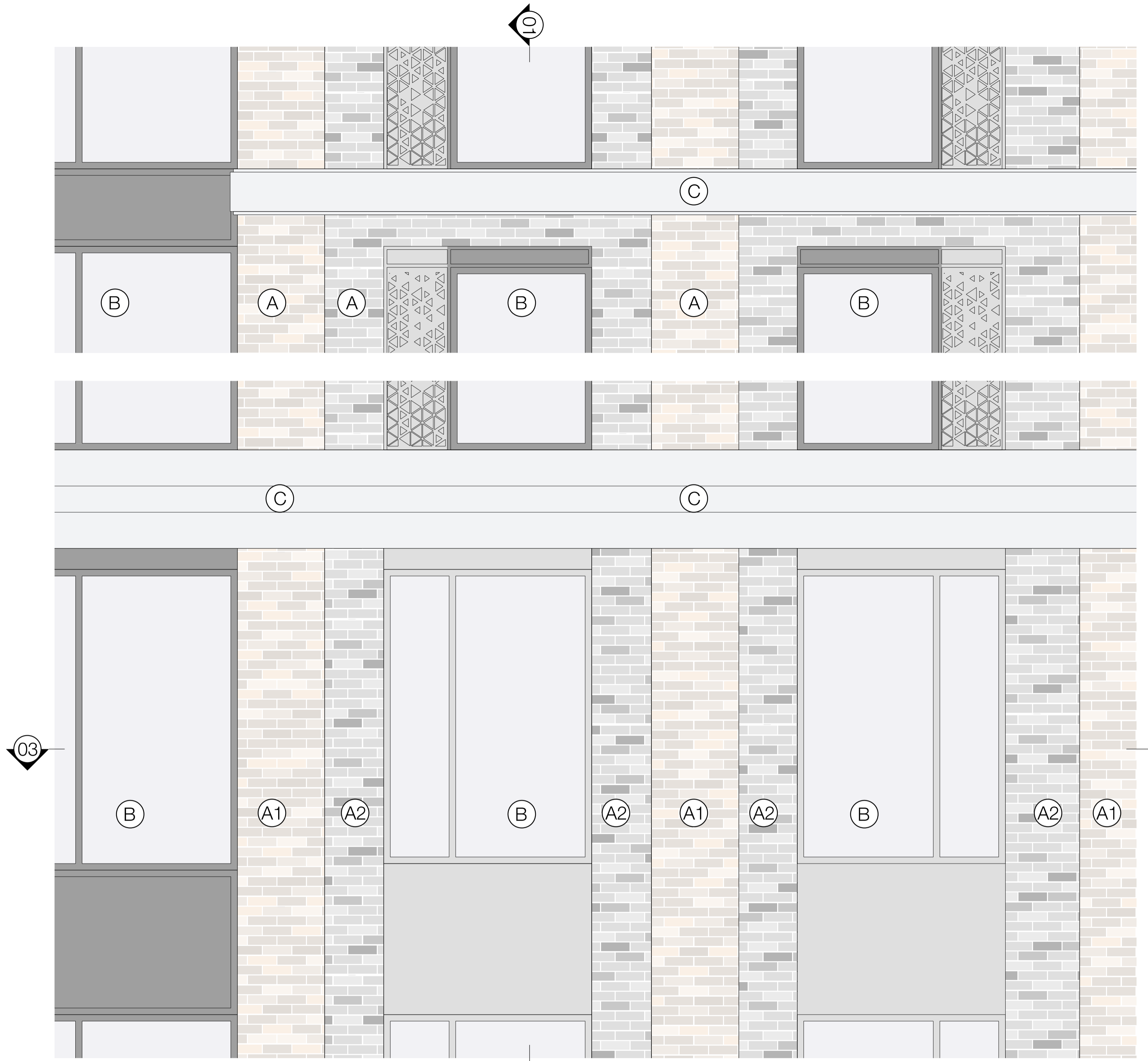
02 Elevation Scale 1:20