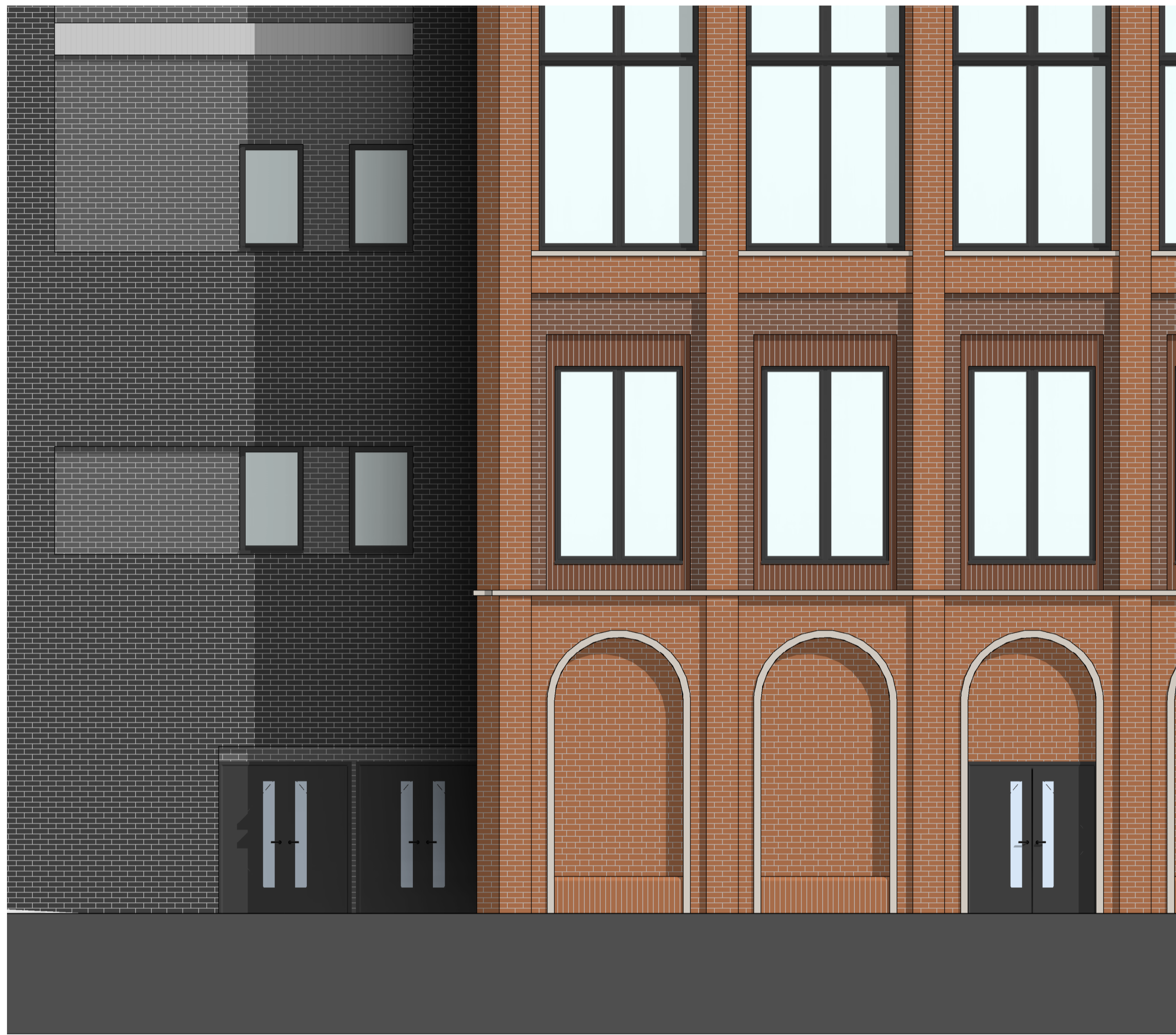
02 - East Elevation Proposed Detail Lower 1 : 50