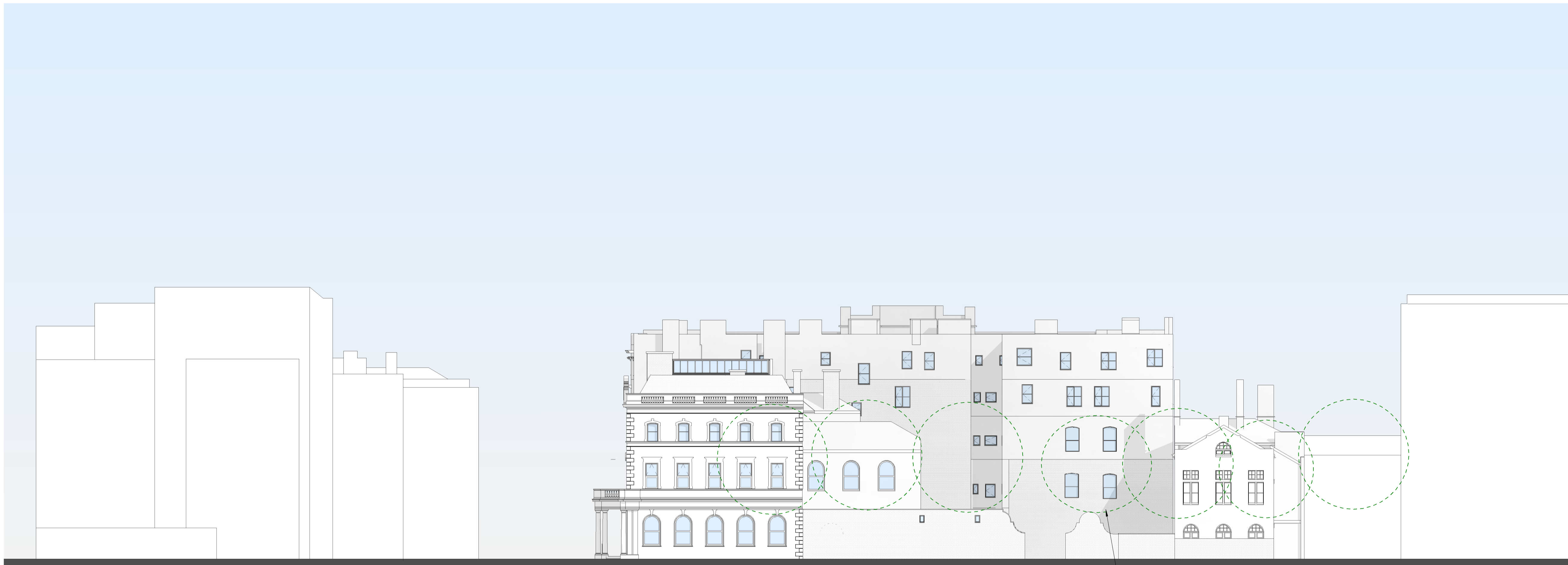
Existing East Context Elevation 1 : 200