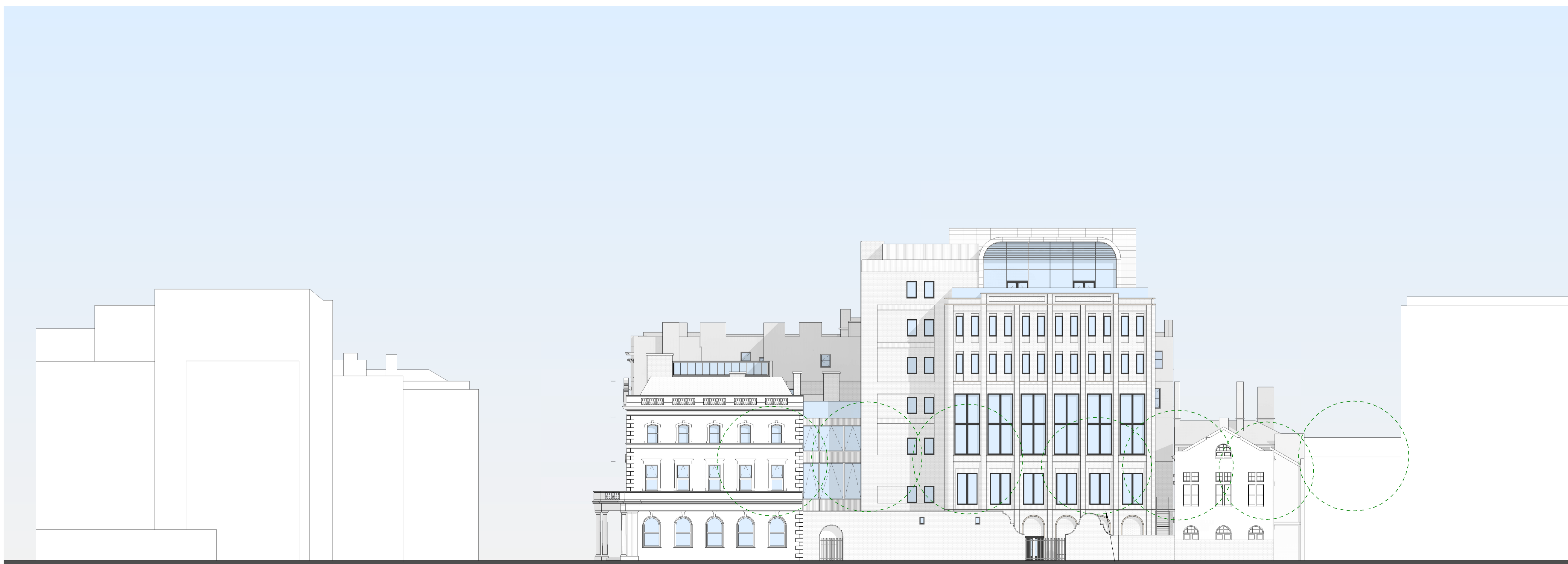
Proposed East Context Elevation 1 : 200