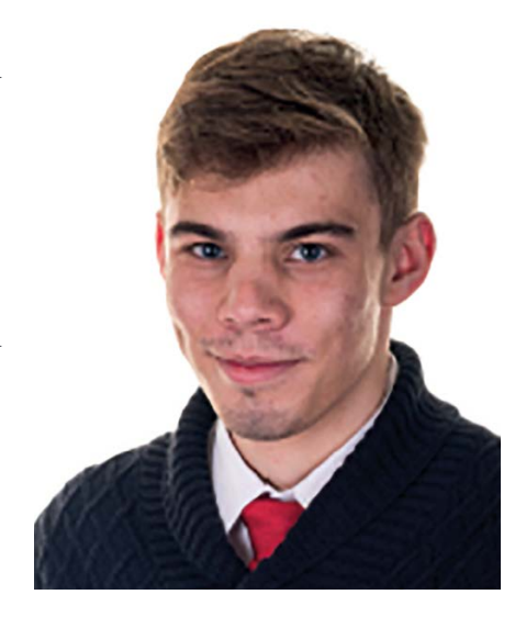
recommend Cardiff Sixth Form College to anyone wanting to study A-levels in the UK".

"Cardiff definitely brought me one step closer to what seemed like an impossible dream for me. The teachers were thoroughly dedicated in their roles and I was blessed with the most caring group of teachers, all of whom helped me to make remarkable progression, especially in topics I have never studied before. I had numerous opportunities to enrich my life and broaden my horizons during my time at the College. These two years were very exciting and fruitful. I would