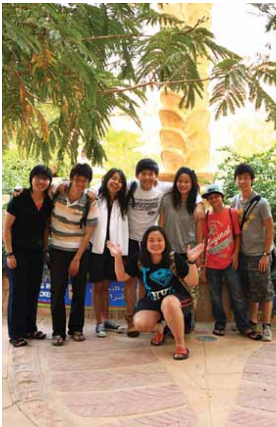
Delegates on the college's Goodwill Ambassador Programme to Bahrain

“...it is both an honour and a pleasure to be able to study at such a respectable institution.”