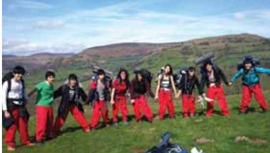
Students on the college Duke of Edinburgh Programme

With a 'work hard, play hard' ethos, CSFC has helped me to develop both academically and socially whether it is by participation in the annual Cultural Event or through my involvement in Debate and Badminton clubs. I believe my time here at CSFC has been an incredible experience, and it is both an honour and a pleasure to be able to study at such a respectable institution. These cherished moments are experiences which will stay with me long after I have left CSFC, my second home.