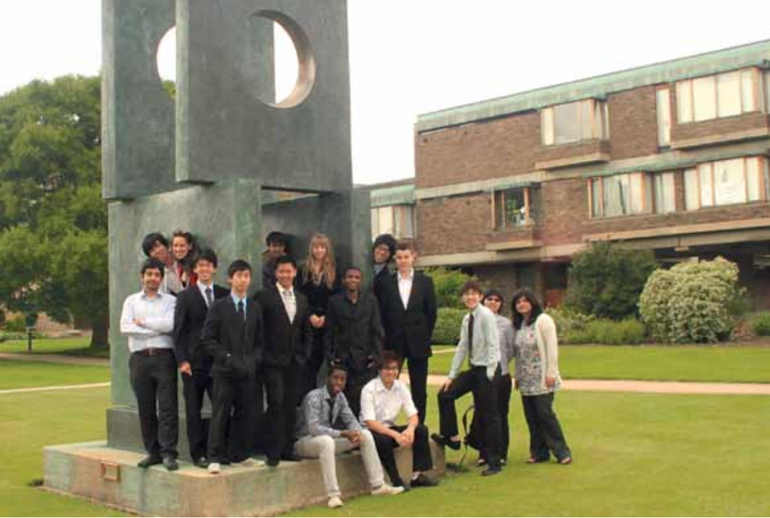
Students on a college trip to Churchill College, Cambridge University

At CSFC, there is a constant drive for excellence as the college strives to help us stand out amongst a large crowd of quality applicants, whether it is through insightful work placements or through the participation of extra-curricular activities like the Duke of Edinburgh or the Nuffield Bursary Scheme. The latter gave me the opportunity to work alongside a research scientist in search of anti-inflammatory therapeutics for conditions like arthritis and septicaemia during my summer, while work experience in both laboratory and clinical settings helped cement my decision to study Medicine. The college Goodwill Ambassador Programme is another incredible experience which involves carrying out work experience and charity work in a foreign country. All of this has helped shape me, preparing me for university life.